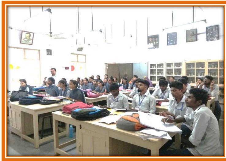
Students at the Programme