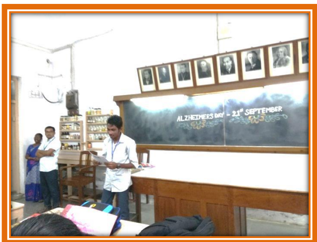
I B.Sc. (CBZ) students expressing their view about the disease